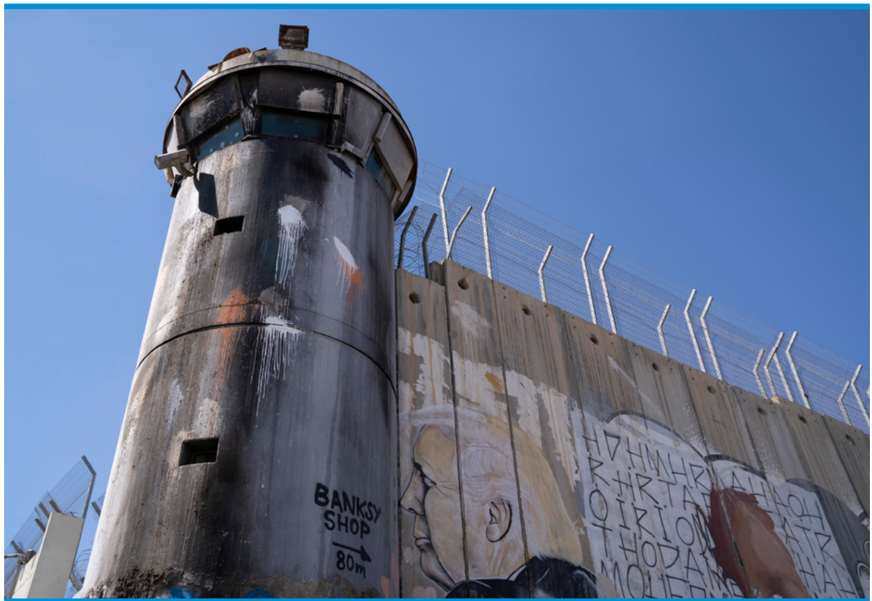
A section of the separation wall in Bethlehem.

Ask young people to design their mural either on paper or on tablets or laptops using appropriate apps or paint tools. Show slide 18, which lists some things to consider for this project.