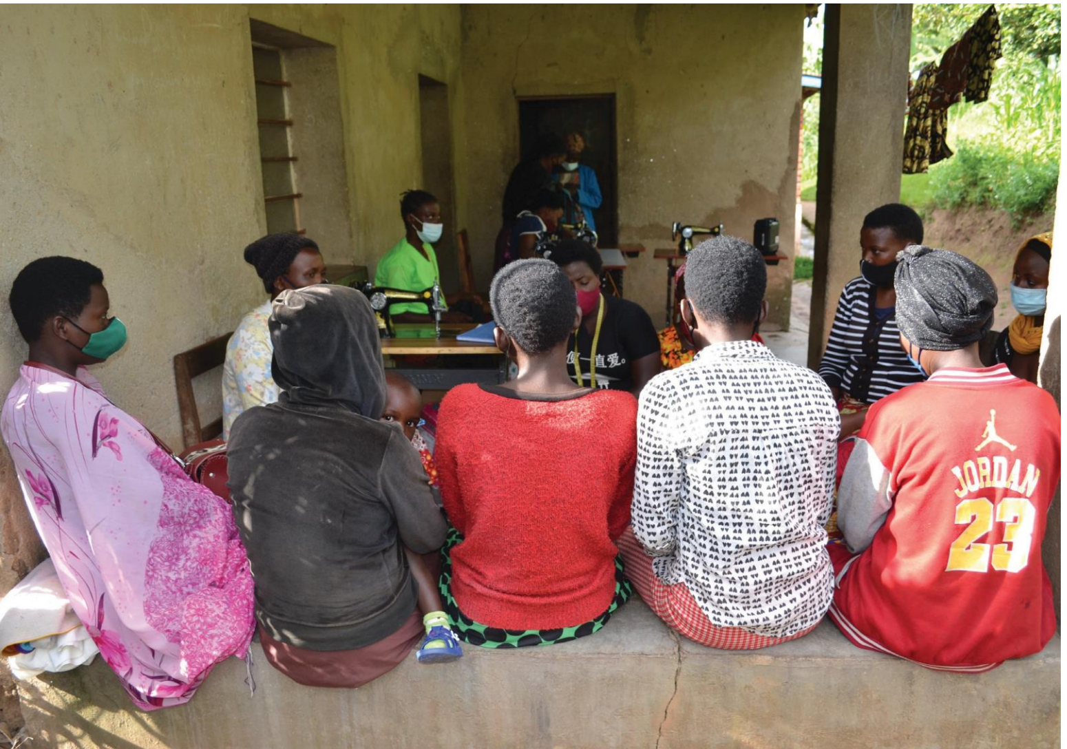
Group of graduated students located in Cyanika Sector, Karama Cell, Karama Village

“The project was much needed because we had several cases of teen mothers some of whom were from poor families. So there was a need to equip them with vocational skills that they needed to be able to fend for themselves.”