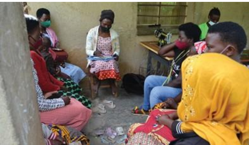
Beneficiaries of Trócaire project in Cyanika gathering for a saving and loan association meeting.

It is a sunny afternoon in Cyanika sector. A group of about ten young women sit on a circle surrounding bank notes of various values. They are convening in an ordinary session of their village saving and loan association that they chose to name as “Twiubake” (Let us change our living conditions).