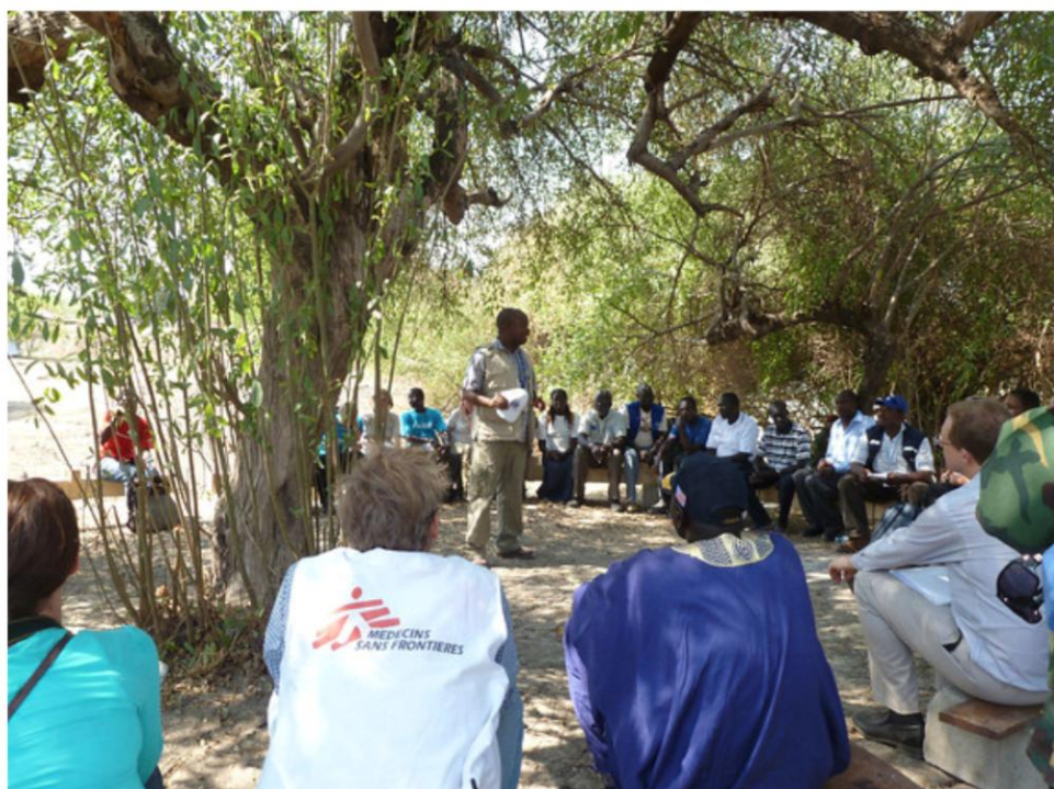
Humanitarian workers at a coordination meeting in South Sudan's Pibor coordination hub, Jonglei State, where inter-communal violence affected nearly 170,000 people. Aid organizations have recorded 165 violent incidents with humanitarian consequences in the first five months of 2012 alone.