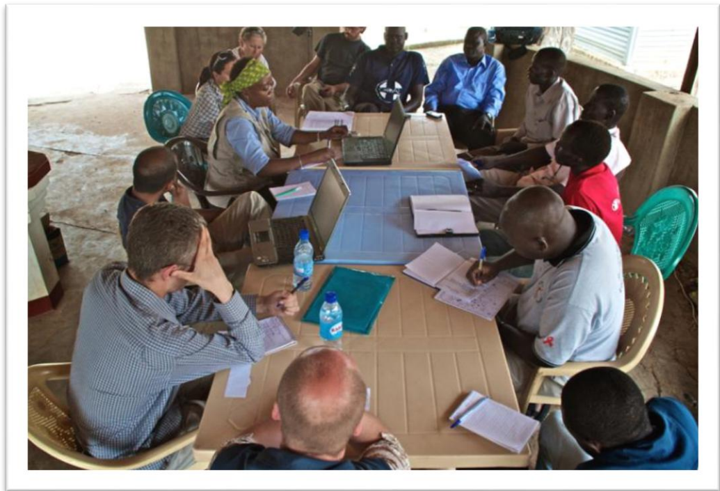
Coordination meeting at Agok in Warrap state, South Sudan. Thousands of residents of Abyei settled in Agok after being displaced by armed clashes in 2011.

The terms of reference of sub-national clusters should follow the core functions of the cluster at the country-level, while at the same time being streamlined and tailored to local operational realities. Accordingly, the working methods of sub-national clusters must be light and focused on service delivery and operational activities; ensuring reporting and information sharing with the national cluster and, through that mechanism, other sub-national clusters; and promoting the involvement of the affected populations in cluster activities to ensure that humanitarian actors respond adequately to their actual needs.