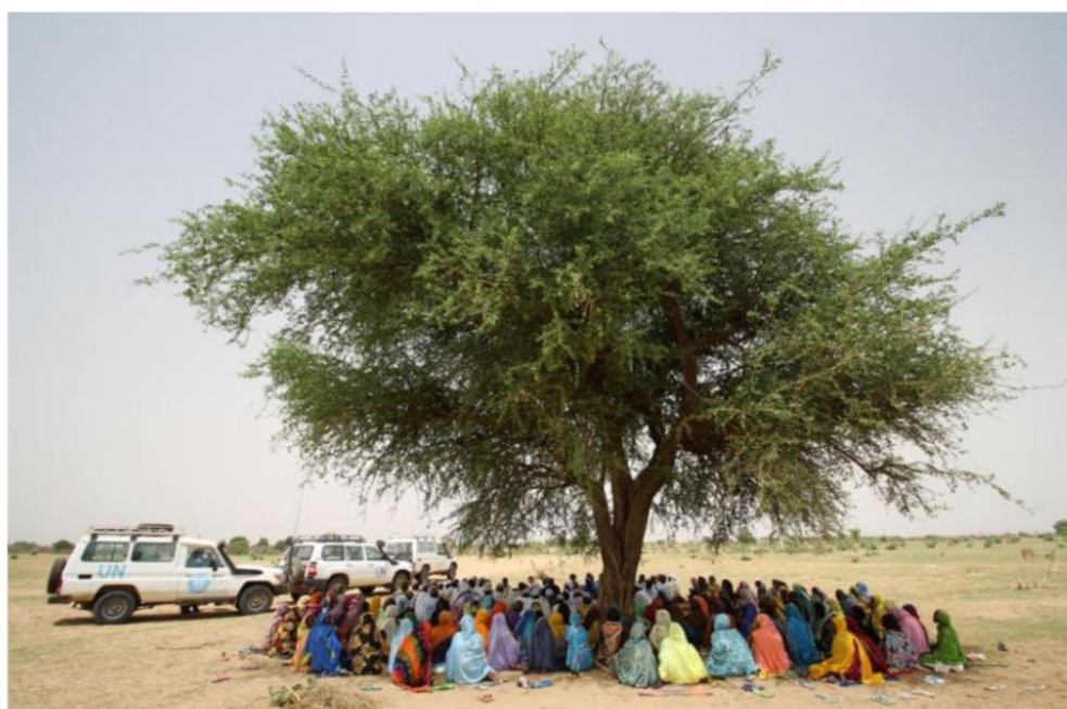
A meeting with returnees in Borota, eastern Chad. The key concern discussed was the lack of clean water.