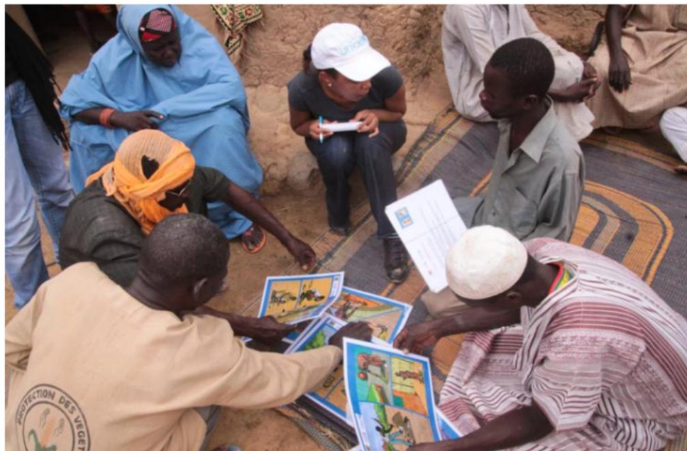
Aid workers conducting cholera awareness campaigns to at-risk communities in Niger. In 2012, nearly 4,000 cholera cases and over 80 deaths have been reported, mostly along the Niger River which recently flooded after heavy rains in the west of the country.

Finally, each cluster is also responsible for integrating early recovery from the outset of the humanitarian response. The RC/HC has the lead responsibility for ensuring early recovery issues are adequately addressed at country level, with the support of an Early Recovery Advisor. The Advisor works on inter-cluster early recovery issues for a more effective mainstreaming of early recovery across the clusters and to ensure that multidisciplinary issues, which cannot be tackled by individual clusters alone, are addressed through an Early Recovery Network 13 . Exceptionally, where early recovery areas are not covered by existing clusters or alternative mechanisms, the RC/HC may recommend a cluster be established in addition to the network to address those specific areas.