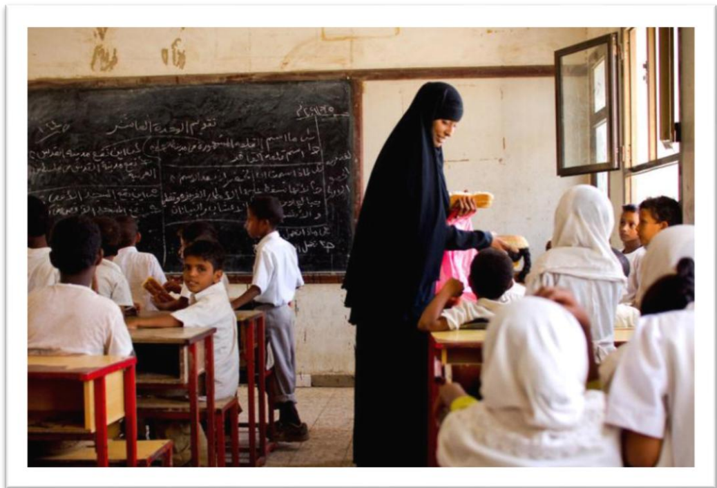
Yemeni girls stay at home to work when food is limited. With one of the greatest gender disparities in the world, school feeding programmes strive to encourage rural families to enrol their young daughters in basic and secondary education.

To facilitate communication with specific groups within the broader membership or outside of the cluster - such as experts in particular technical areas (including cross-cutting issues), military actors, government counterparts, and UN senior leadership - the SAG might also designate cluster partners to serve as a liaisons with these groups.