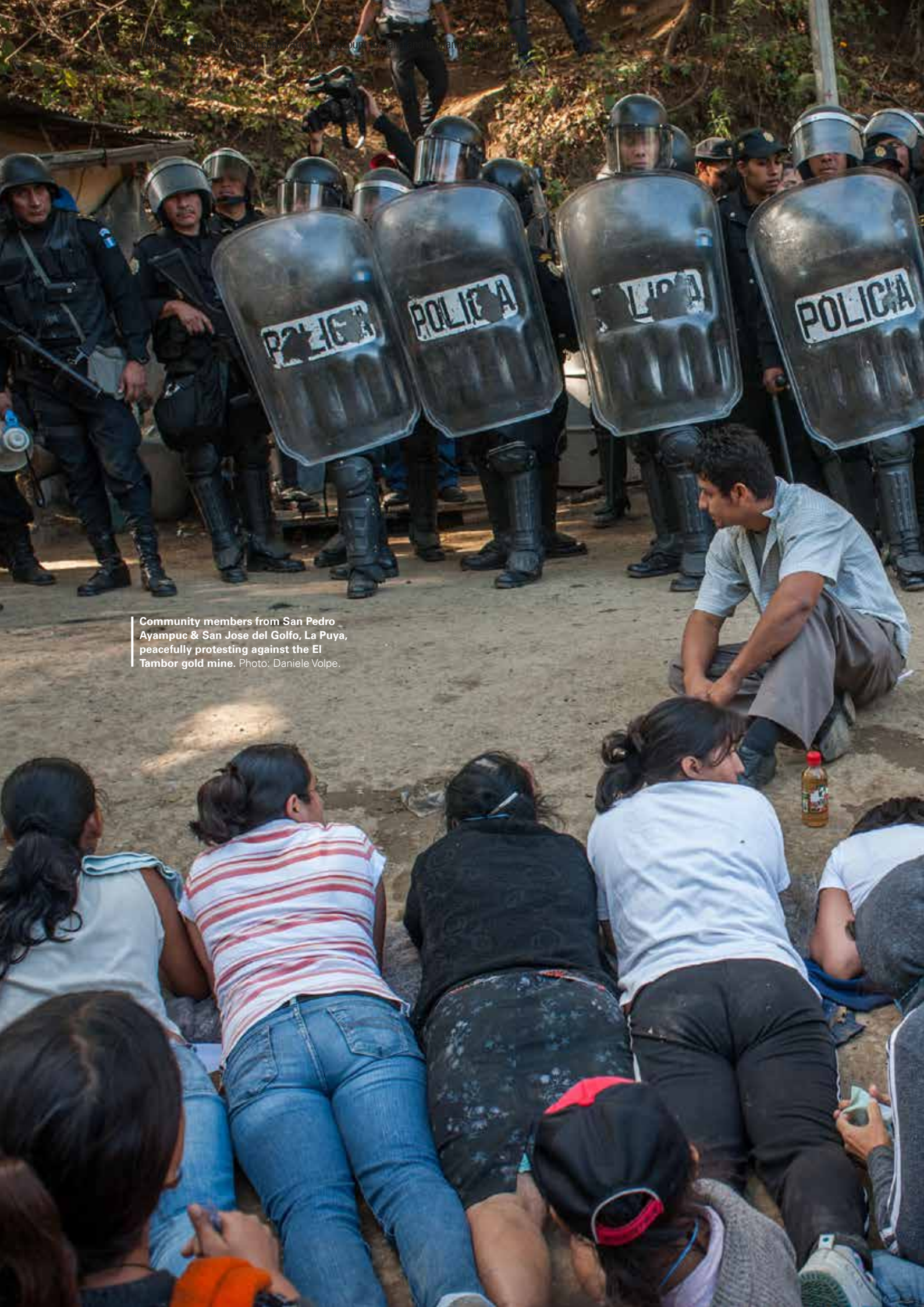
Community members from San Pedro Ayampuc & San Jose del Golfo, La Puya, peacefully protesting against the El Tambor gold mine.