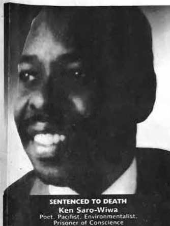
SENTENCED TO DEATH

Send a clear message to the Nigerian regime. Call on Shell International to support Human Rights in Nigeria. Appeal to our government to act now and save Ken Saro-Wiwa.