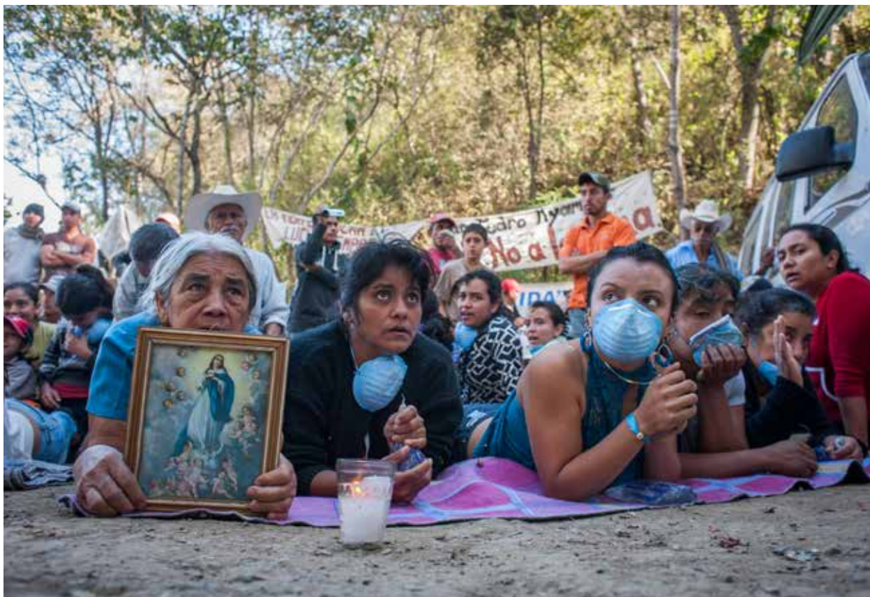
Women from San Pedro Ayampuc & San Jose del Golfo, La Puya, resisting the El Tambor gold mine. The community members are peacefully protesting and surrounded by police.

national security, public morals, defamation, protection of national sovereignty) and can include arbitrary scrutiny of management and internal governance, threats of, or actual, de-registration, forced office closures, search and seizures of property, exorbitant fines, spurious prosecutions, arbitrary arrests and detentions and bans on travel. 68