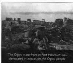
The Ogoni waterfront in Port Harcourt was devastated in attacks on the Ogoni people.

A special tribunal set up by Nigeria's military regime has sentenced Mr. Ken Saro-Wiwa, leader of the Ogoni people, to death by hanging. Many international human rights groups, including Amnesty International and Human Rights Watch have questioned the legality and fairness of this trial.