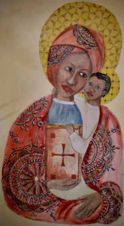
Mural of the Virgin Mary holding the Baby Jesus and the word of God in the parish church in Ishiara, Kenya.

‘The word of God is like the light of the sun, it illuminates beautiful things but also things which we would rather not see.’ (St Óscar Romero)